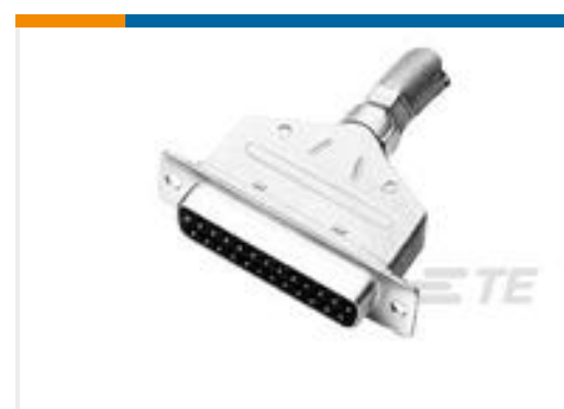
TE Part # 747548-8 KIT, RCPT, 25P, HDE, SHLD HDWRE